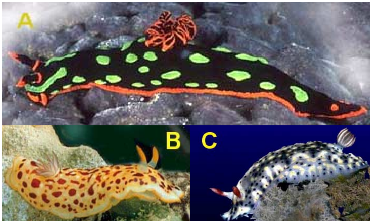
Figure 1. Underwater photographs of (A) Nembrotha kubaryana collected from the lagoon of Pohnpei, Federated States of Micronesia, (B) Chromodoris petechialis , Koko Head, Hawaii and (C) Hypselodoris infucata feeding on the sponge Dysidea fragilis , Kaneohe Bay, Hawaii.

Compound 1 was found to be a potent antimicrobial agent; active against B. subtilis at 5 µg/disc. Nakafuran-8 and -9 were not found to be antimicrobial, though they have previously been reported as having fish antifeedant properties [12]. Spongian-16-one ( 2 ) has been reported as cytotoxic [11]. Too little material was available to perform antimicrobial assays.